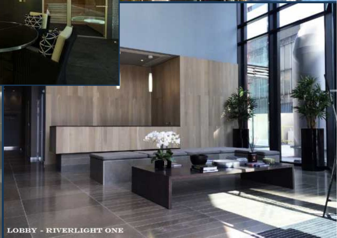
LOBBY - RIVERLIGHT ONE