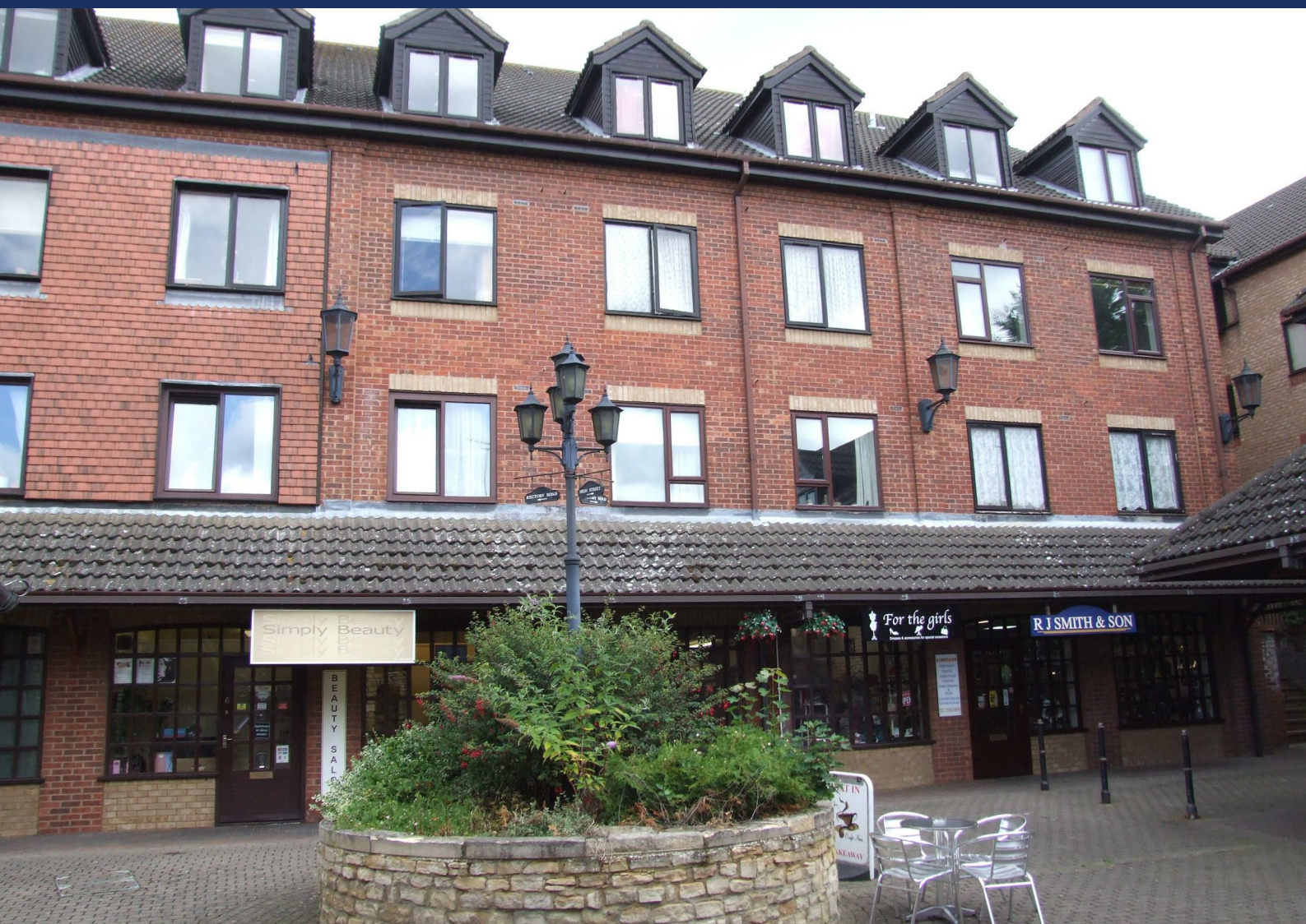
Ashleigh House Hamblin Court, Rushden Northamptonshire NN10 0RU