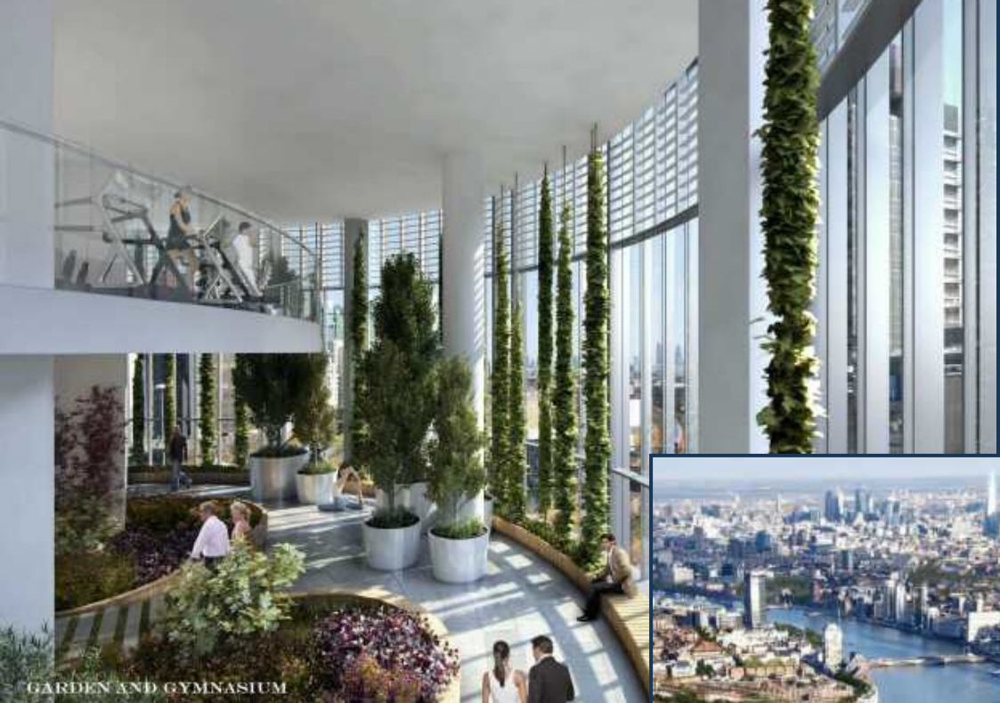
GARDEN AND GYMNASIUM