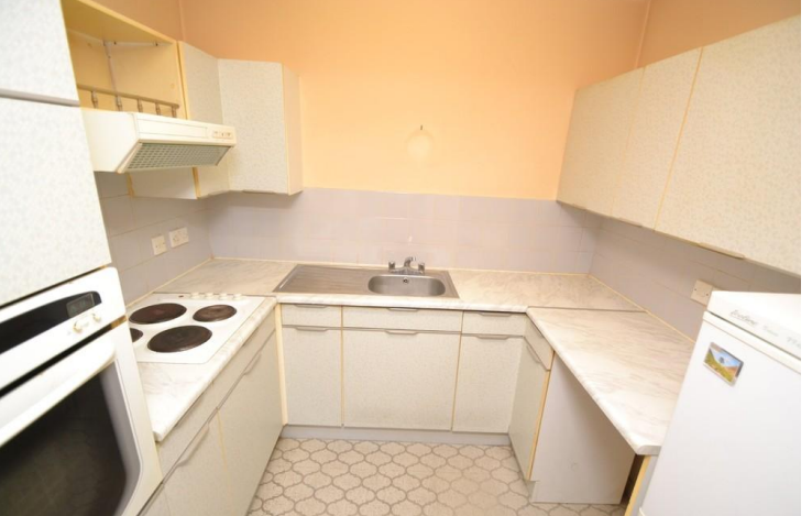
The Greenwoods, Sherwood Road | | South Harrow | HA2 8DW

One bedroom ground floor warden assisted retirement flat for over 55's only in sought after block conveniently located opposite South Harrow's Piccadilly Line tube and bus station with its busy shopping centre.