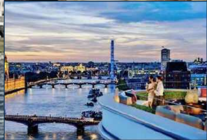
THE CORNICHE, 20 ALBERT EMBANKMENT, £699,999