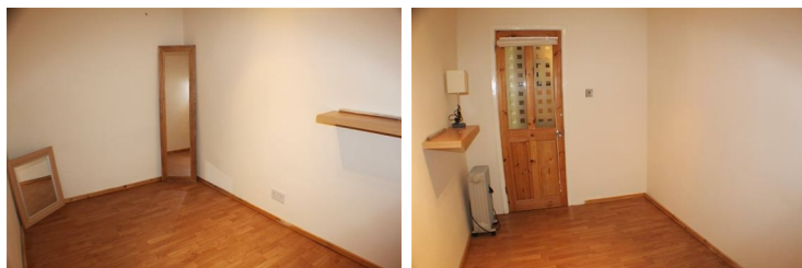
Laminate flooring throughout. Power points.