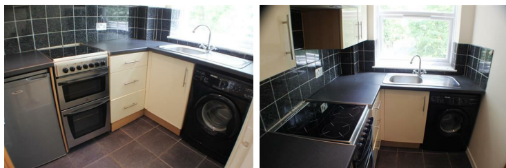
Floor standing and wall mounted units in cream gloss with black worktops. Tiled flooring. Window to front aspect.