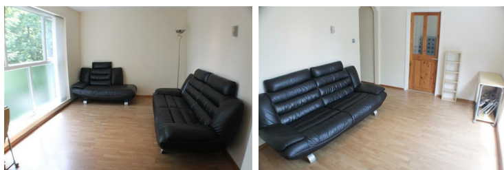
Window to front aspect. Laminate flooring.