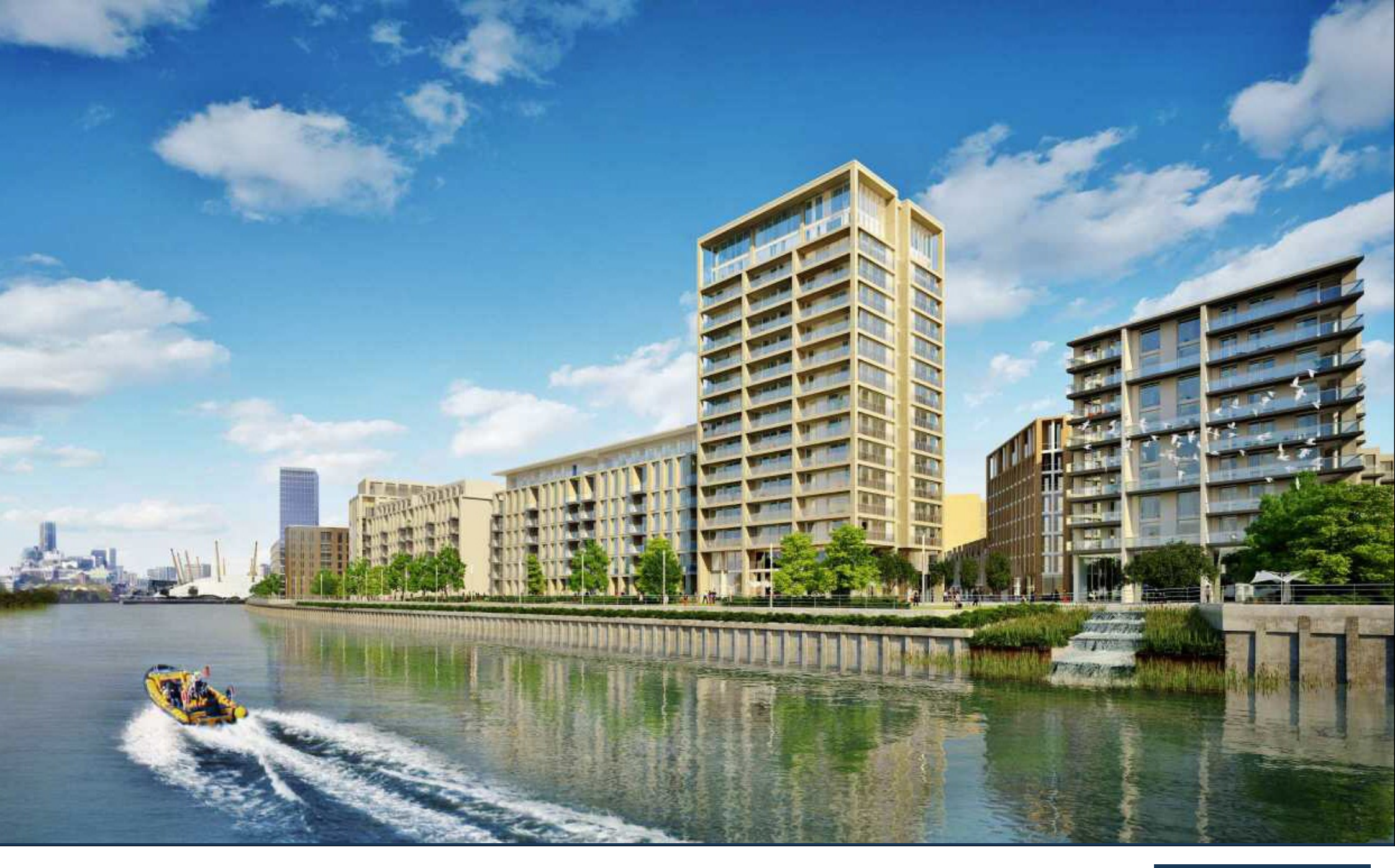
FLAGSHIP BUILDING, ROYAL WHARF £359,775