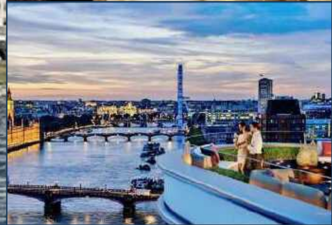
THE CORNICHE, 20 ALBERT EMBANKMENT, £695,000