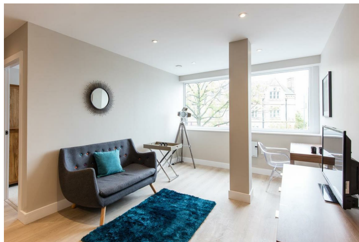
With front aspect window and timber flooring, open plan leading into the kitchen.