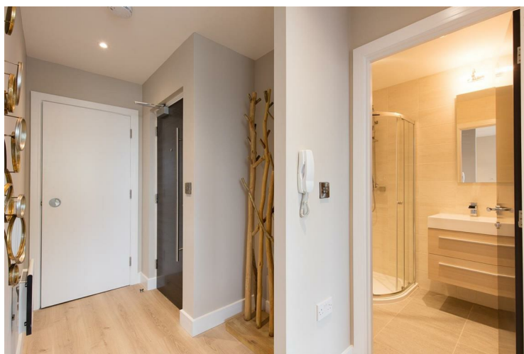
Entrance hallway with timber floors and storage cupboard with washing machine.