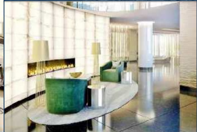
THE CORNICHE, 20 ALBERT EMBANKMENT, £637,750