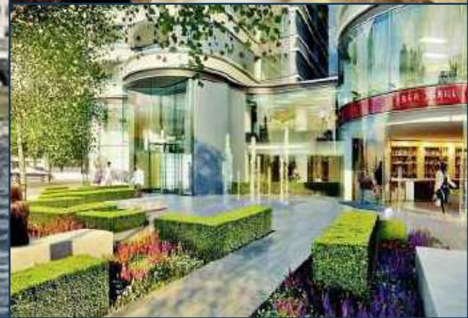
THE CORNICHE, 20 ALBERT EMBANKMENT, £825,000