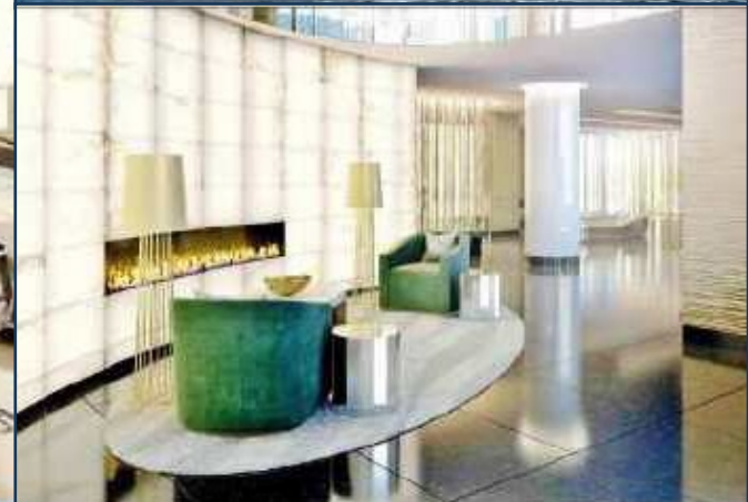
THE CORNICHE, 20 ALBERT EMBANKMENT, £637,750