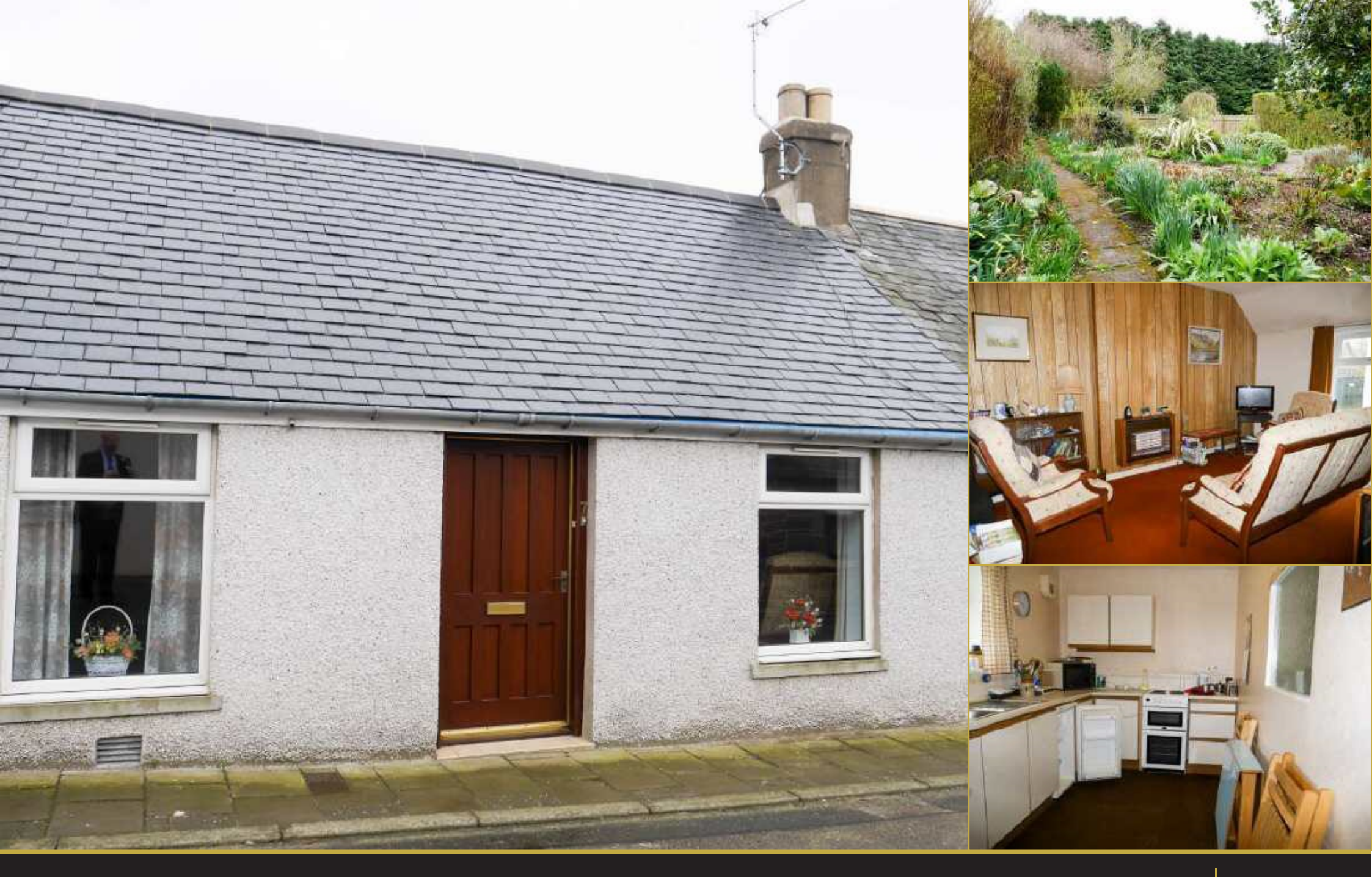
7 Gardenston Street, Laurencekirk Offers over £130,000