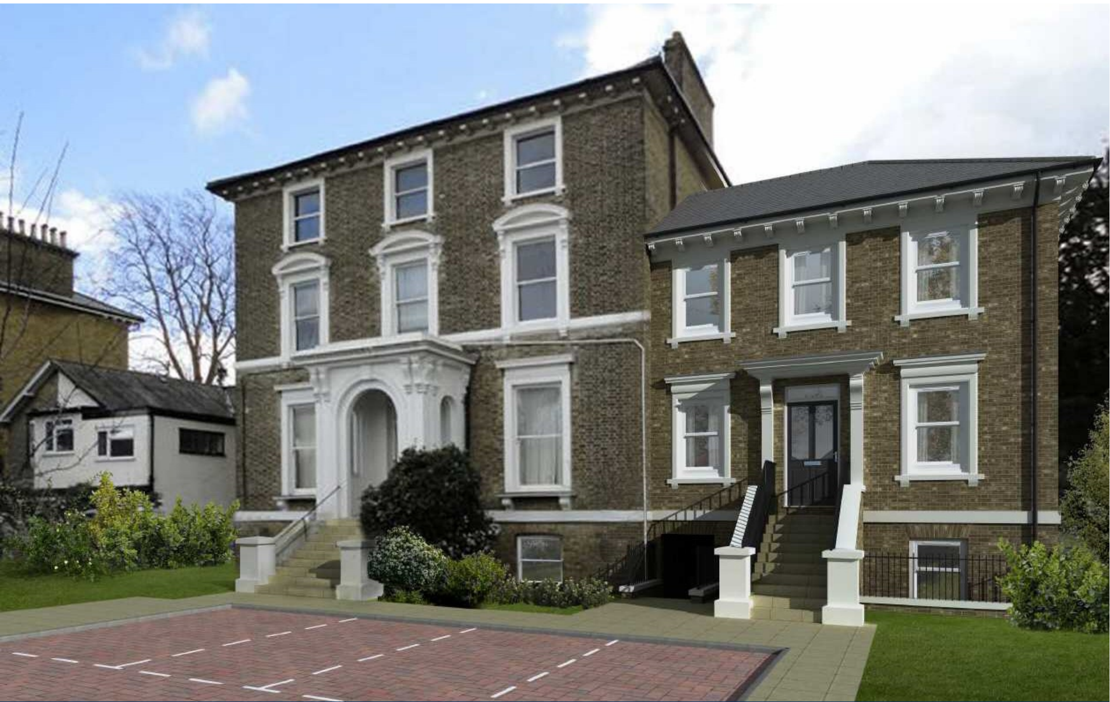
Apartment 2 Coopers Lodge, 246 Southlands Road, Bromley, Kent, £400,000