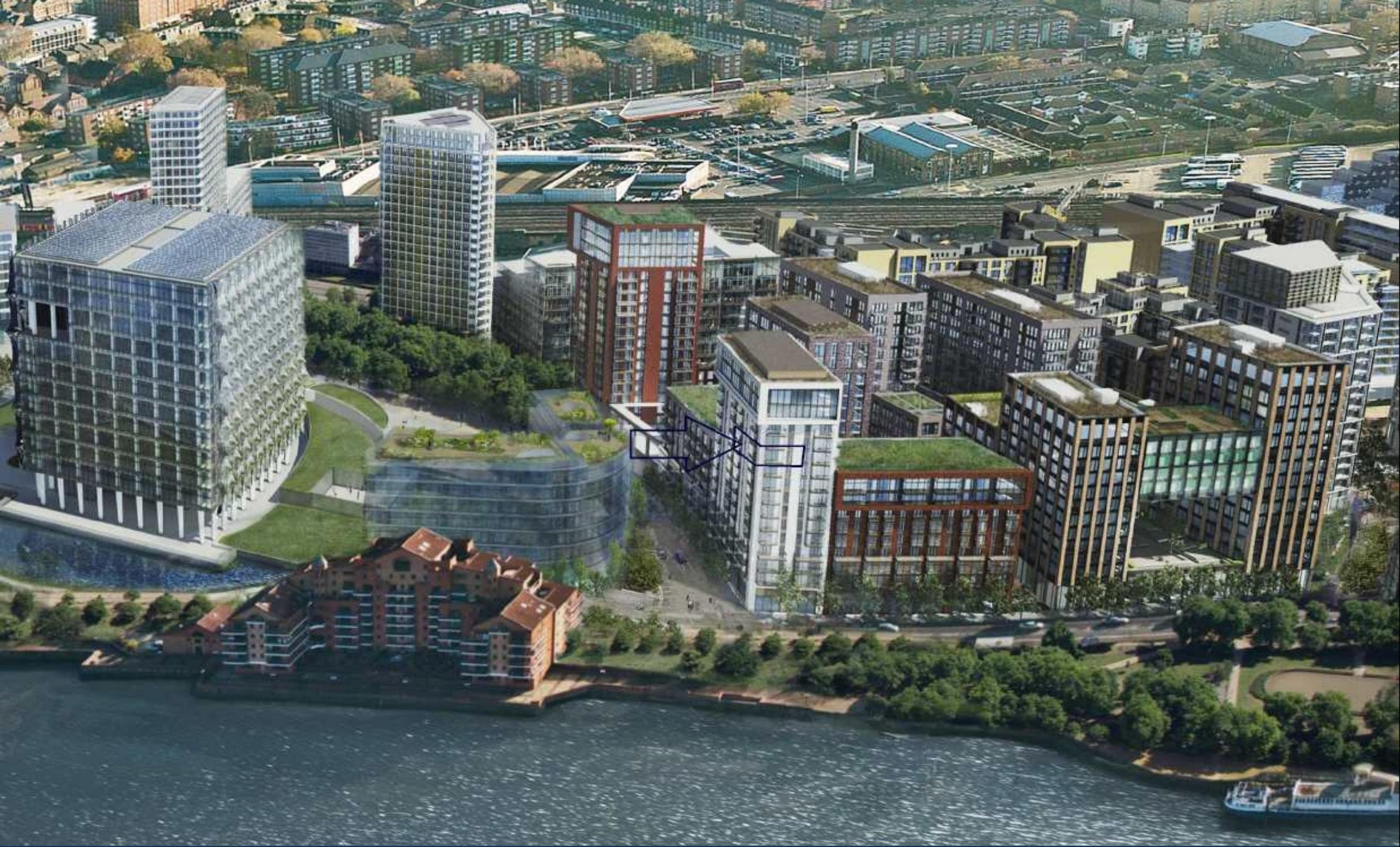
AMBASSADOR BUILDING, EMBASSY GARDENS, £1,425,000