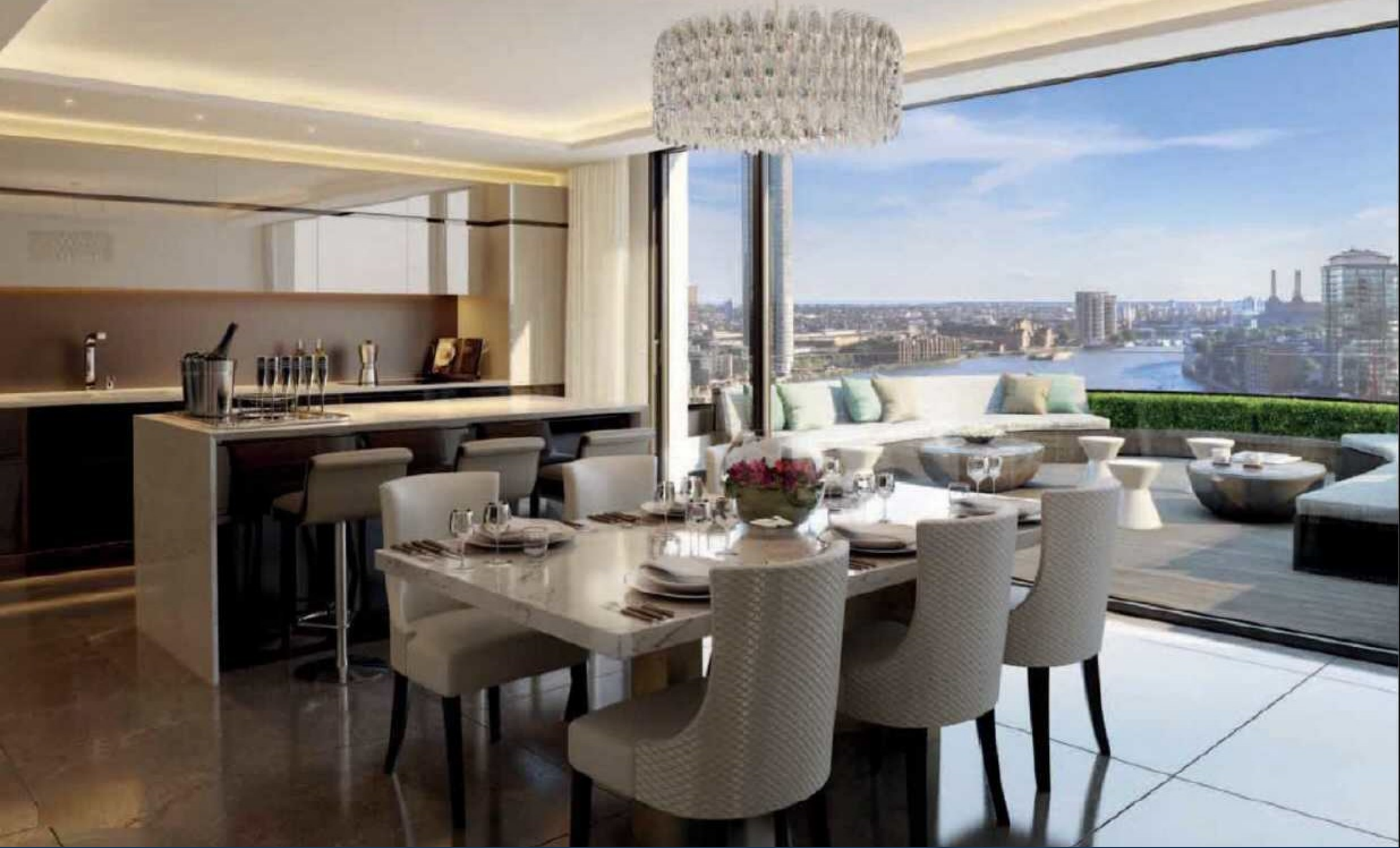
THE CORNICHE, 20 ALBERT EMBANKMENT, £2,800,000