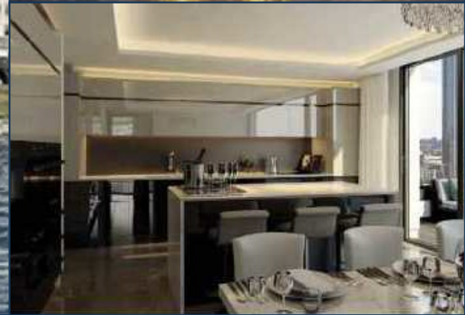
THE CORNICHE, 20 ALBERT EMBANKMENT, £1,150,000