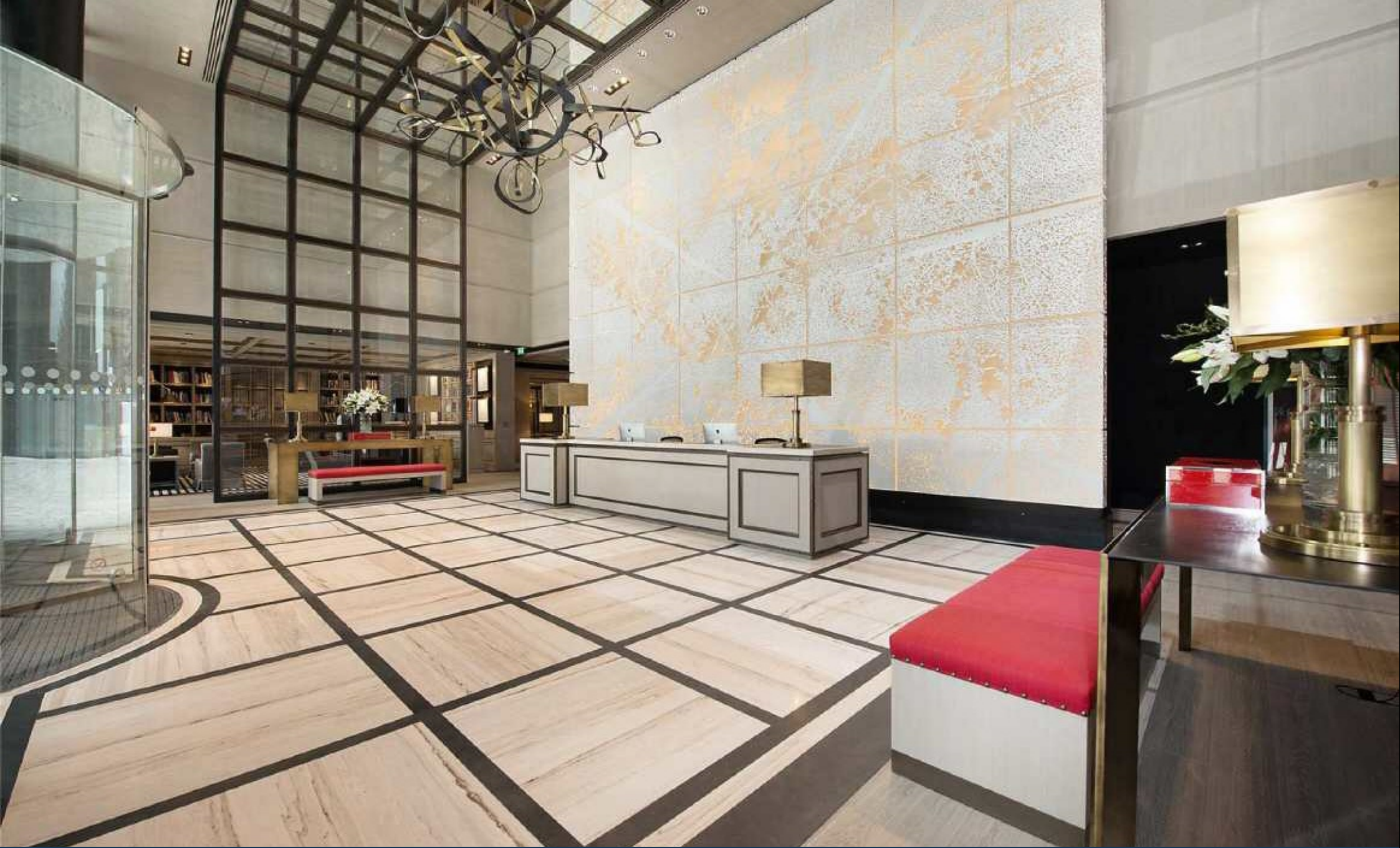
CAPITAL BUILDING, EMBASSY GARDENS, NINE £950,000