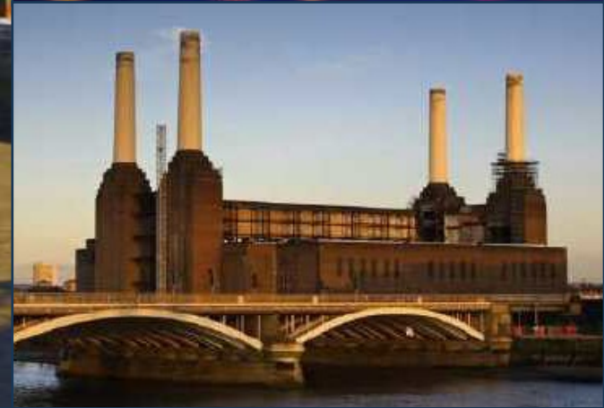
FARADAY HOUSE, BATTERSEA POWER STATION, £949,950