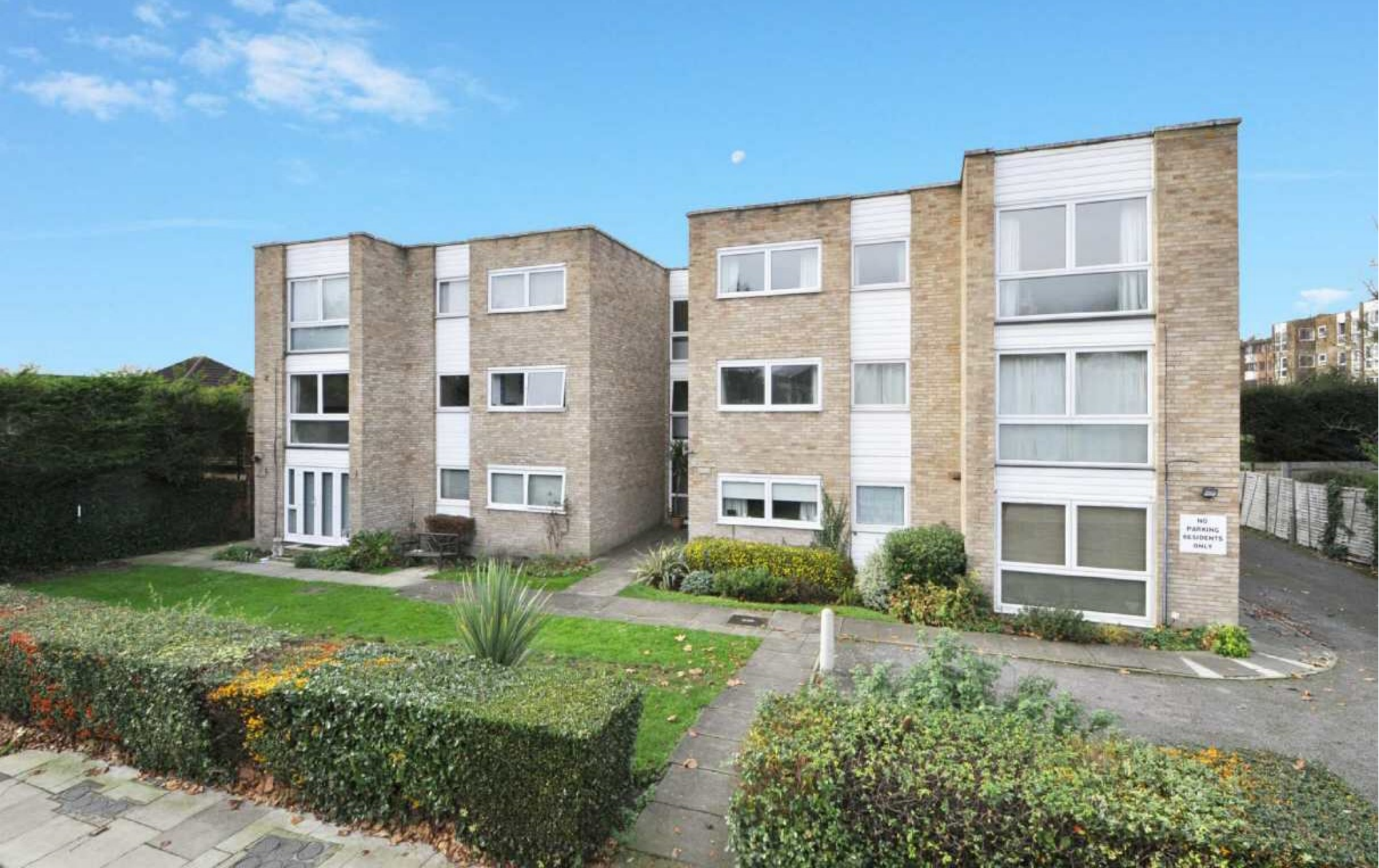
Silverstone Court, Wanstead Road, Bromley BR1 Guide price £340,000