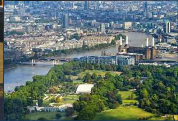
FLADGATE HOUSE, BATTERSEA POWER £975,000