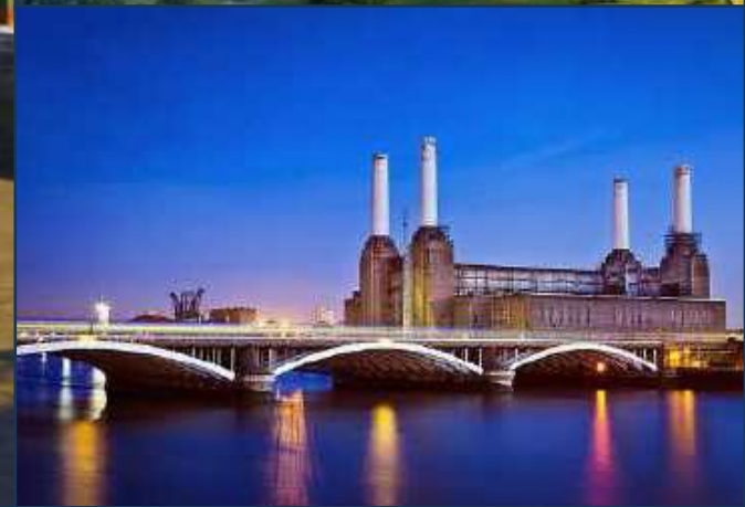
FARADAY HOUSE, BATTERSEA POWER STATION, £795,000