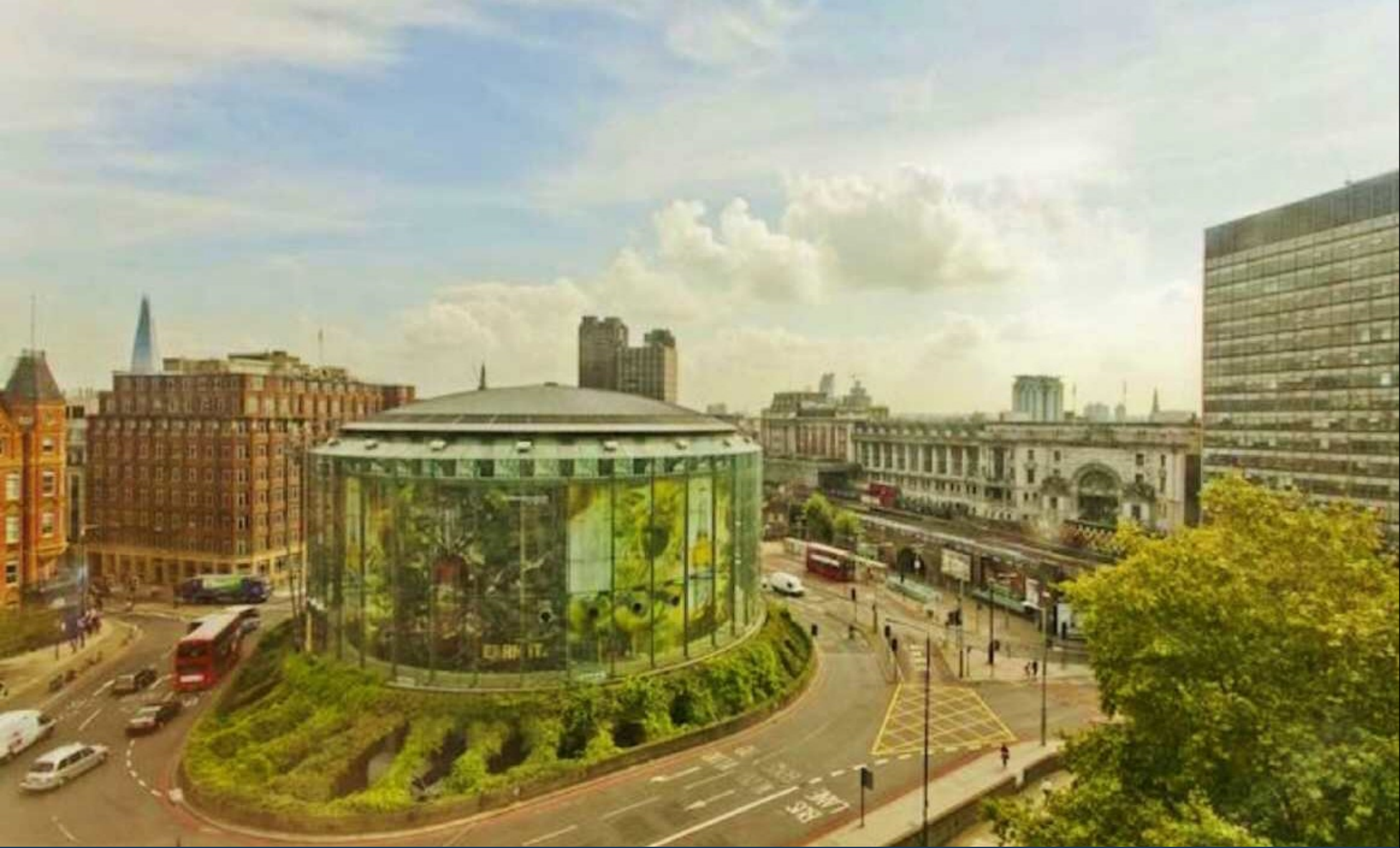
WHITEHOUSE APARTMENTS, SOUTH BANK £915,000