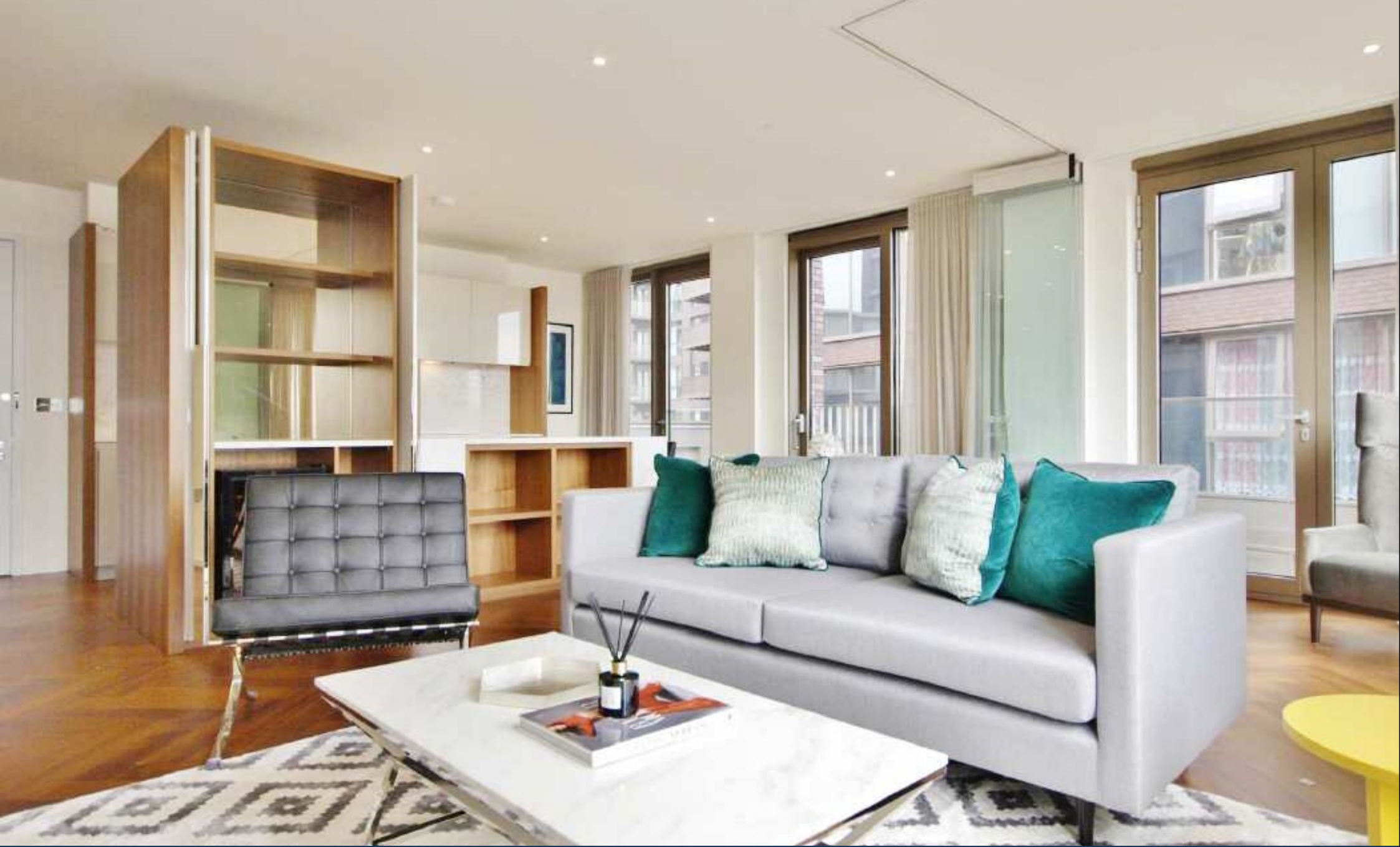
CAPITAL BUILDING, EMBASSY GARDENS, NINE £1,125,000