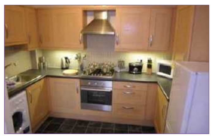
MODERN FITTED KITCHEN