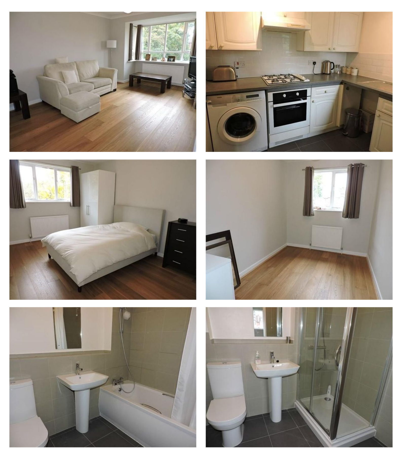
Broomfield Estates give notice to anyone reading these particulars that: (i) these particulars do not constitute part of an offer or contract; (ii) these particulars and any pictures or plans represent the opinion of the author and are given in good faith for guidance only and must not be construed as statements of fact; (iii) nothing in the particulars shall be deemed a statement that the property is in good condition otherwise; we have not carried out a structural survey of the property and have not tested the services, appliances or specified fittings.