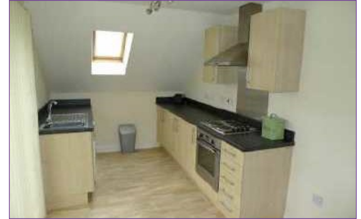
MODERN FITTED KITCHEN