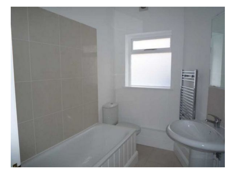
Broomfield Estates give notice to anyone reading these particulars that: (i) these particulars do not constitute part of an offer or contract; (ii) these particulars and any pictures or plans represent the opinion of the author and are given in good faith for guidance only and must not be construed as statements of fact; (iii) nothing in the particulars shall be deemed a statement that the property is in good condition otherwise; we have not carried out a structural survey of the property and have not tested the services, appliances or specified fittings.