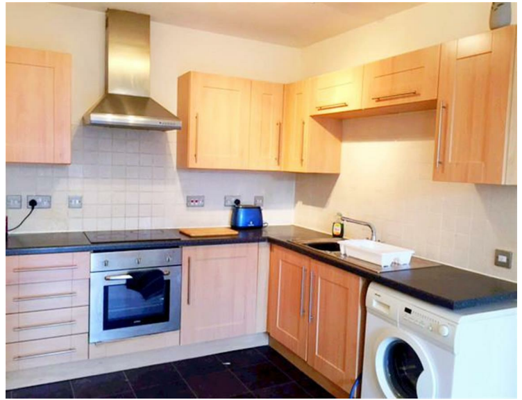
Beech wall and base units, dark speck work top and neutral walls and splashbacks