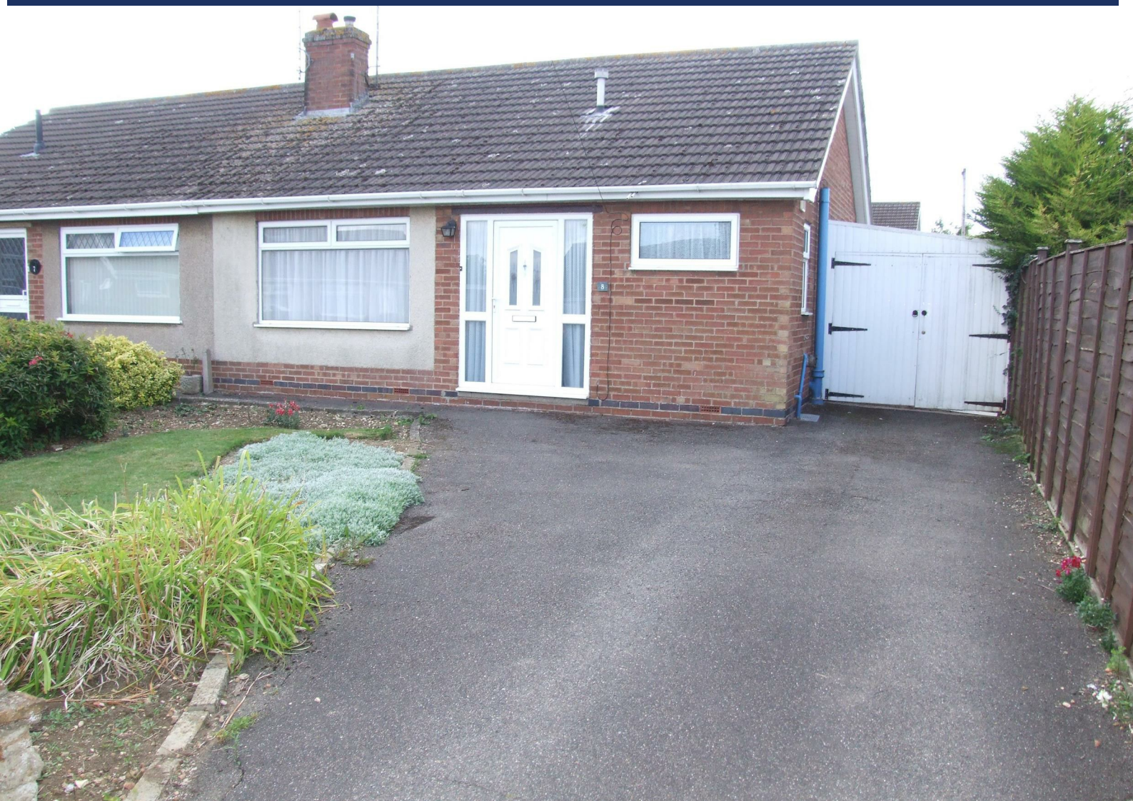
8 Pine Close, Rushden Northamptonshire NN10 9HD