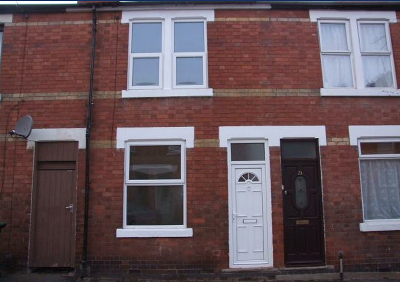
19 Pemberton Street, Rushden Northamptonshire NN10 9TW