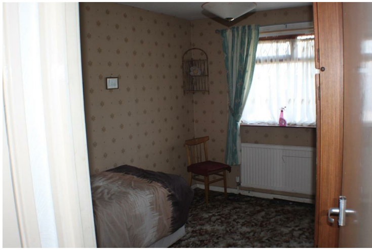
Bedroom Two has carpeted floor, front facing window with power points and a radiator.