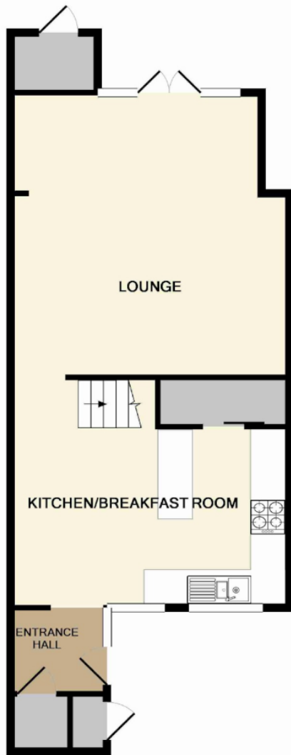
GROUND FLOOR APPROX. FLOOR AREA 48.9 SQ.M. (527 SQ.FT.)