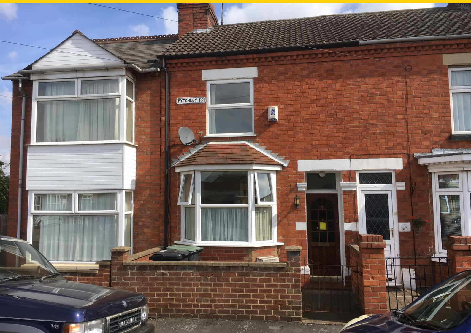
3 Pytchley Road, Rushden Northamptonshire NN10 9XB