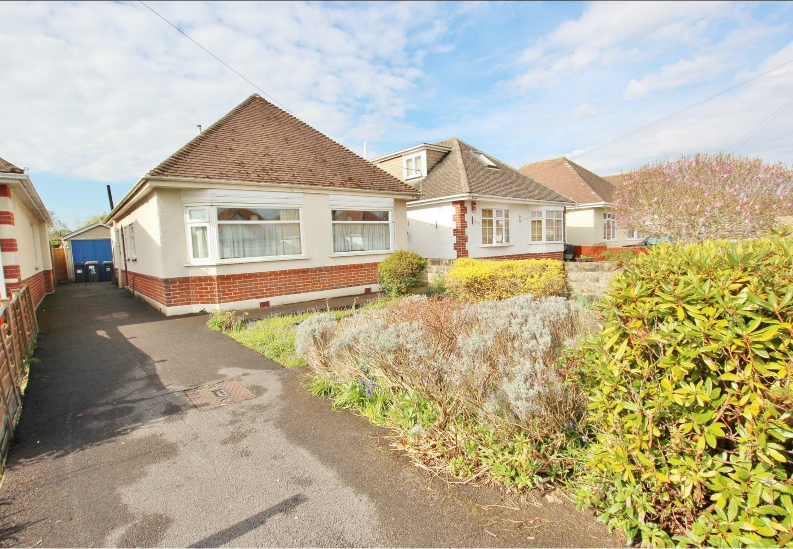
28 Wynford Road, Bournemouth, Dorset, BH9 3ND £290,000