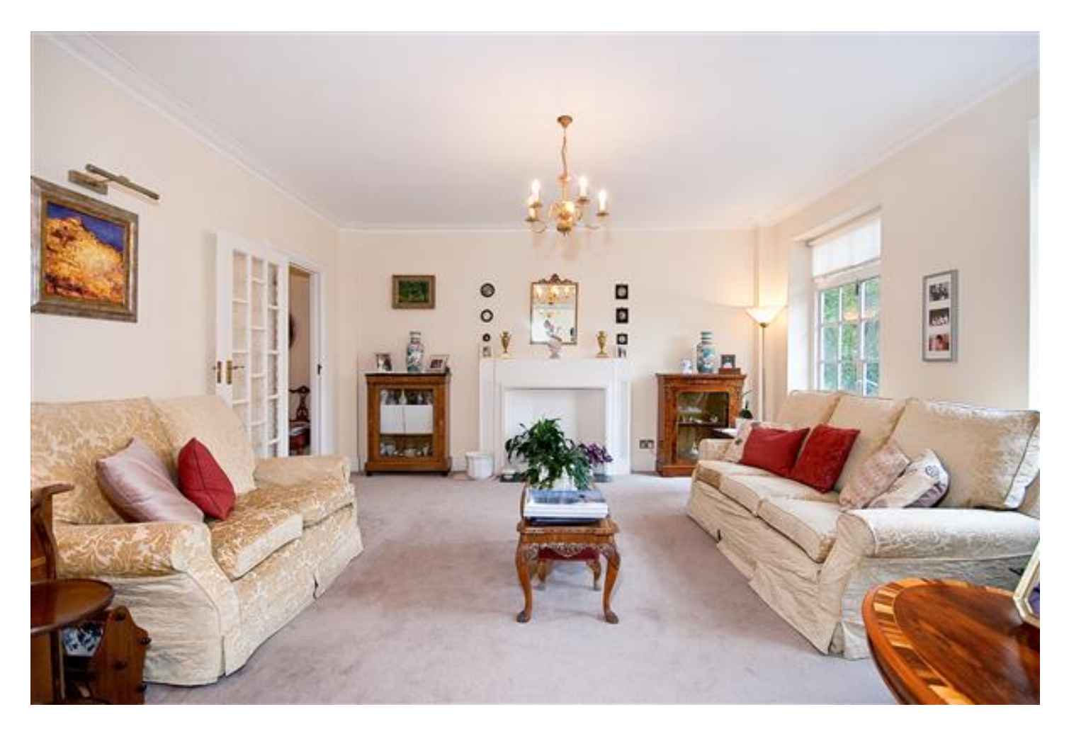
FLORENCE COURT, MAIDA VALE, LONDON, W9

Marble Arch Office, 29-31 Edgware Road, London W2 2JE Tel: 020-7724-3100 Fax: 020-7258-3090