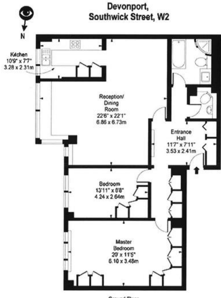
Ground Floor Approx Gross Internal Area 1080 Sq Ft - 100.33 Sq M For Illustration Purposes Only - Not To Scale Floor Plan by www.bpmmediagroup.com Ref. No. P47375

Marble Arch Office, 29-31 Edgware Road, London W2 2JE Tel: 020-7724-3100 Fax: 020-7258-3090