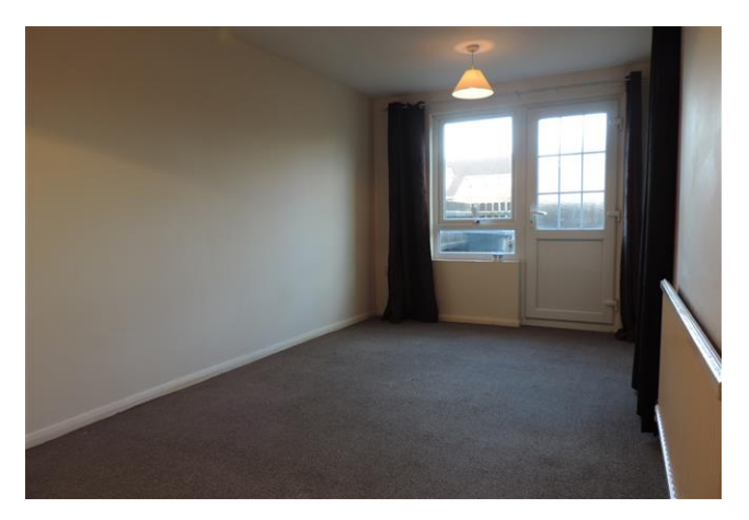
£375 Per Calendar Month