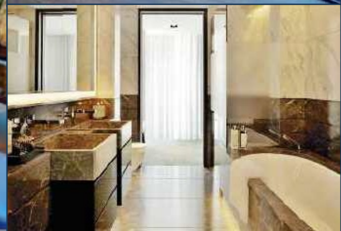
THE CORNICHE, 20 ALBERT EMBANKMENT, £2,999,950