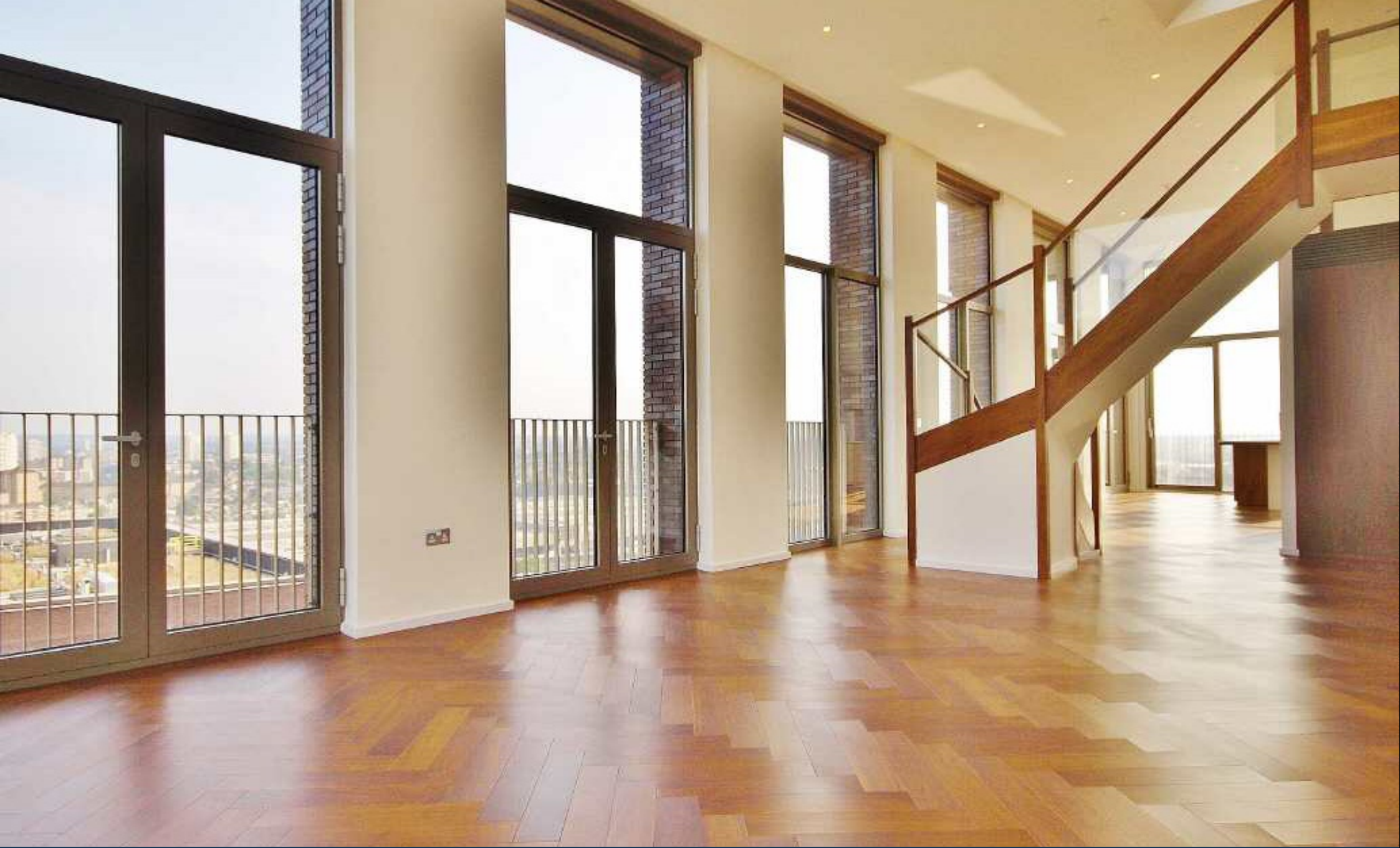
CAPITAL BUILDING, EMBASSY GARDENS, NINE £3,050,000