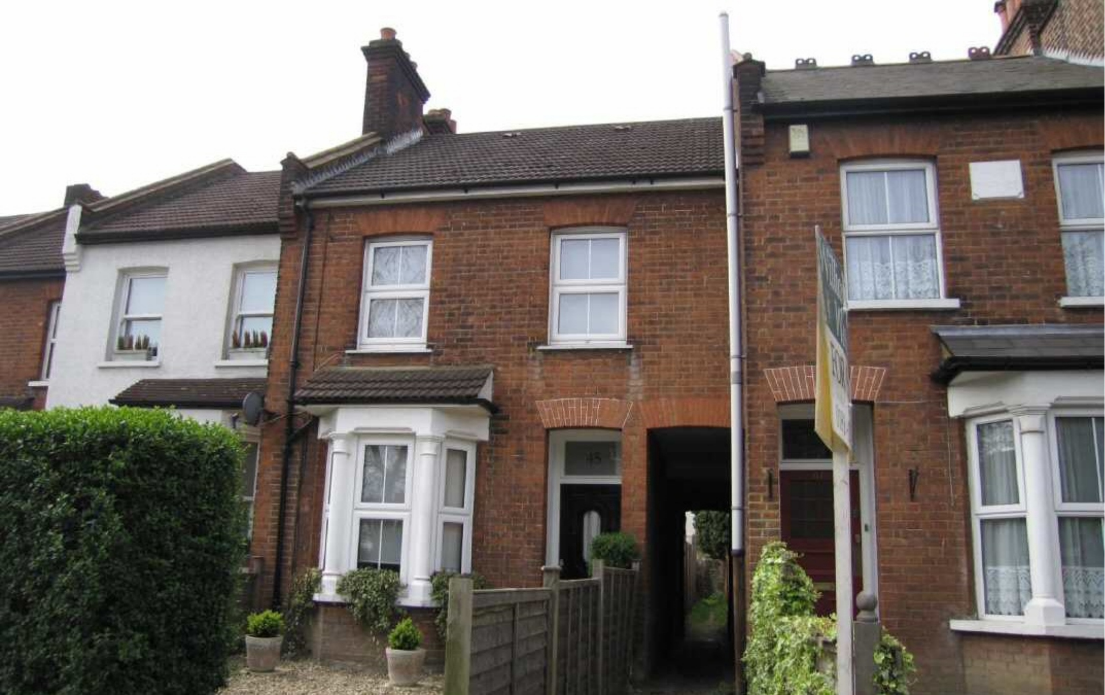
Chislehurst BR7 £1,500 Per calendar month