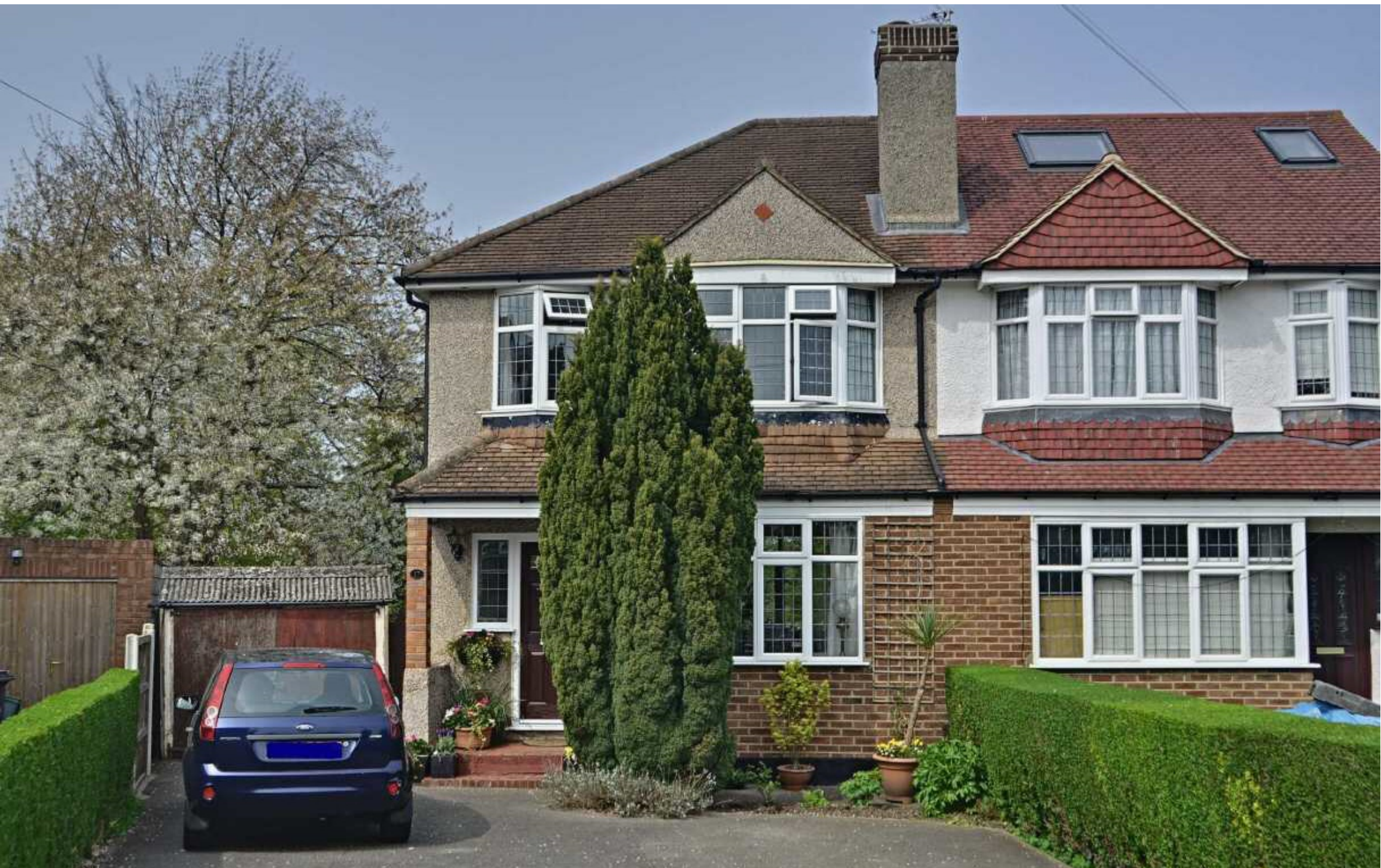
Rosecroft Close, Orpington, BR5 4DX Guide price £425,000 to £450,000