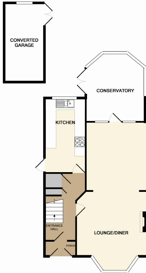
GROUND FLOOR APPROX. FLOOR AREA 810 SQ.FT. (75.3 SQ.M.)