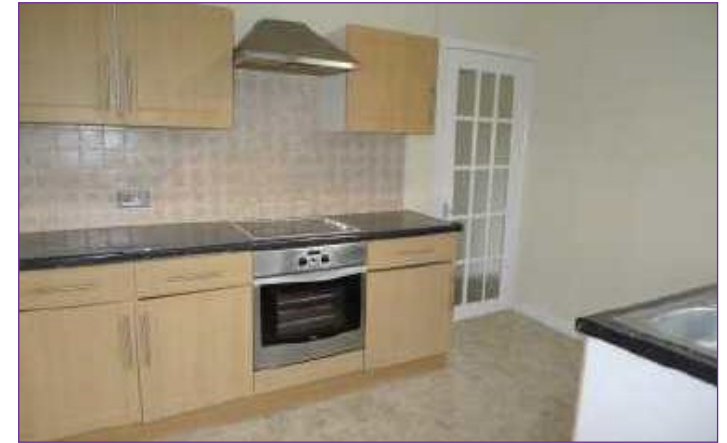
MODERN FITTED KITCHEN