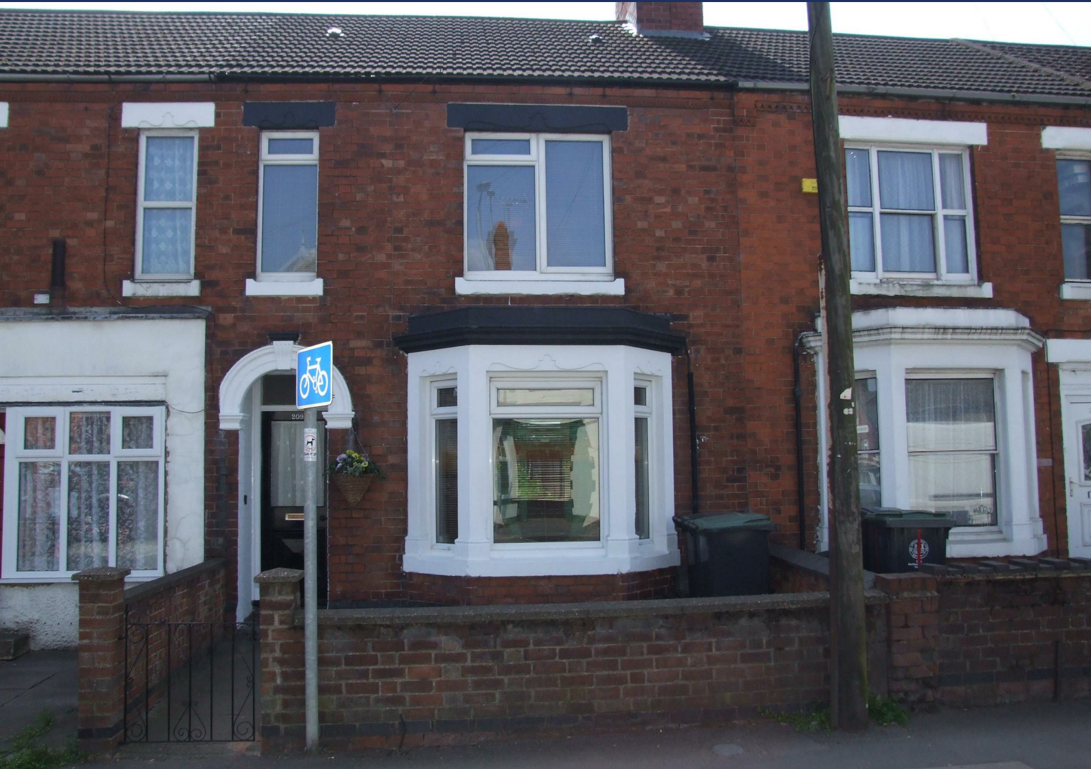
209 Wellingborough Road, Rushden Northamptonshire NN10 9SZ