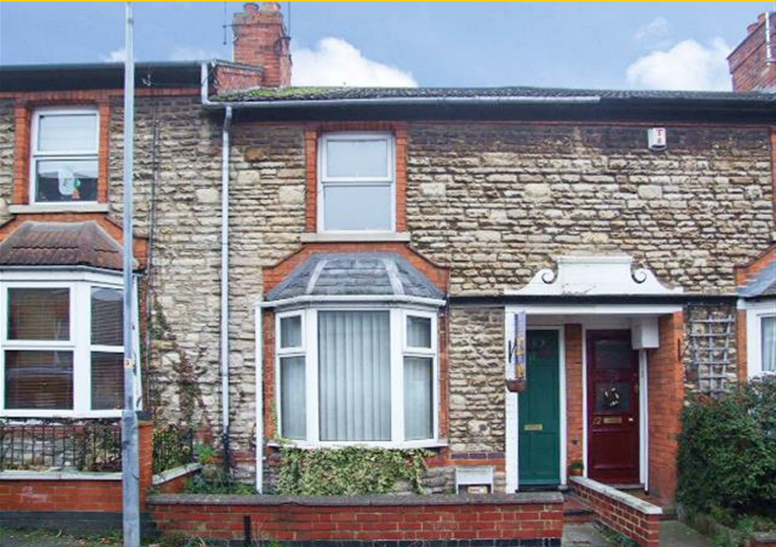
14 Harborough Road, Rushden Northamptonshire NN10 0LT