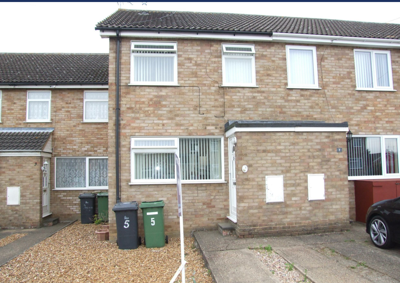
5 Saxon Rise, Irchester Northamptonshire NN29 7AU