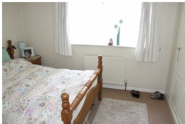
Bedroom 2 11'1" x 6'7" (3.37m x 2.01m) Maximum including built in wardrobe