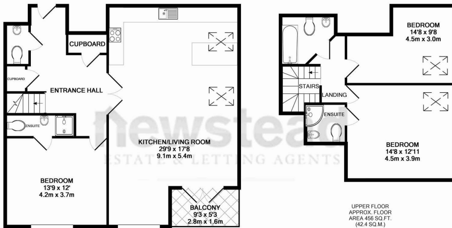
LOWER FLOOR APPROX. FLOOR AREA 860 SQ.FT. (79.9 SQ.M.)