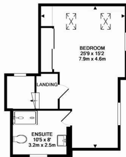
2ND FLOOR APPROX. FLOOR AREA 445 SQ.FT. (41.3 SQ.M.)

You may download, store and use the material for your own personal use and research. You may not republish, retransmit, redistribute or otherwise make the material available to any party or make the same available on any website, online service or bulletin board of your own or of any other party or make the same available in hard copy or in any other media without the website owner's express prior wr