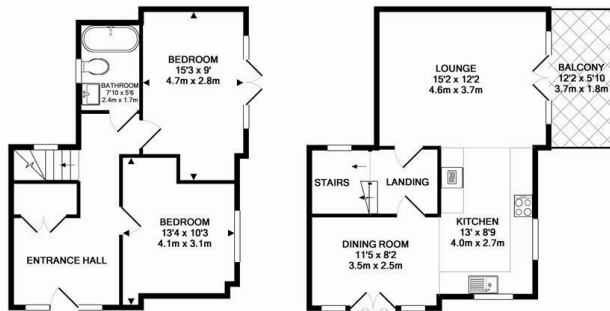
GROUND FLOOR APPROX. FLOOR AREA 445 SQ.FT. (41.4 SQ.M.) 1ST FLOOR APPROX. FLOOR AREA 488 SQ.FT. (45.3 SQ.M.) TOTAL APPROX. FLOOR AREA 1348 SQ.FT. (125.2 SQ.M.) Whilst every attempt has been made to ensure the accuracy of the floor plan contained here, measurements of doors, windows, rooms and any other items are approximate and no responsibility is taken for any error, omission, or mis-statement. This plan is for illustrative purposes only and should be used as such by any prospective purchaser. The services, systems and appliances shown have not been tested and no guarantee as to their operability or efficiency can be given. Made with Metropix 02/16