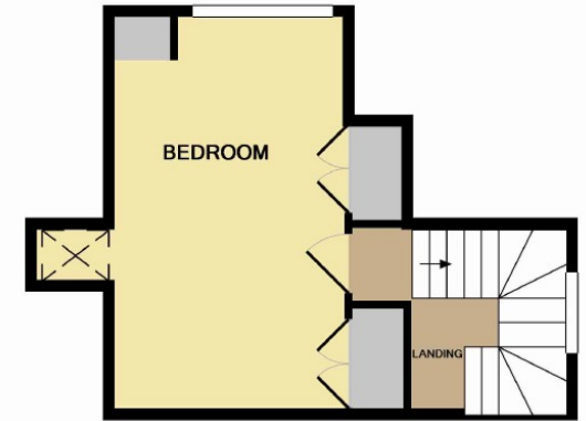
2ND FLOOR APPROX. FLOOR AREA 256 SQ.FT. (23.8 SQ.M.)

TOTAL APPROX. FLOOR AREA 1988 SQ.FT. (184.7 SQ.M.)